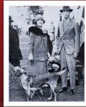
King George VI and Queen