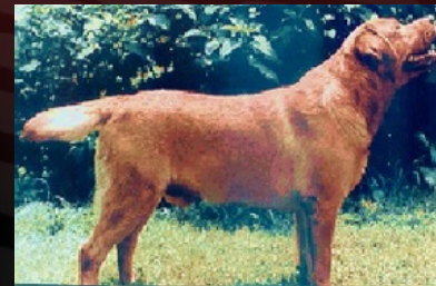
Bslrion Red Alert