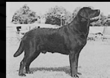
Balrion King Frost